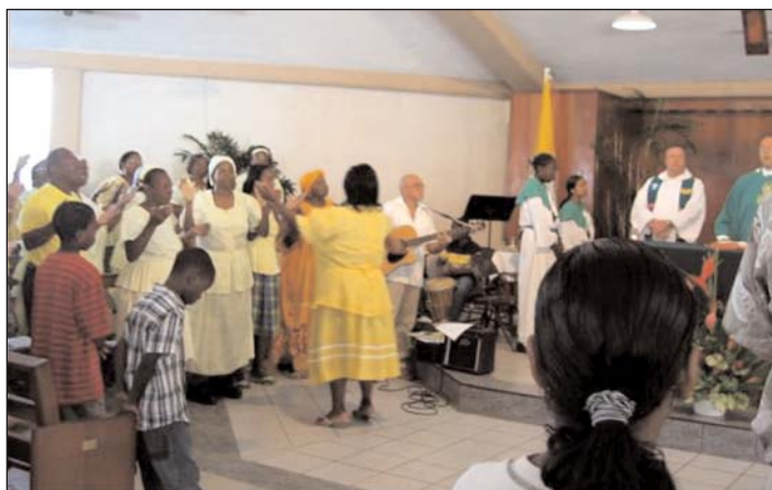
The choir leads the worship at St. Martin's

Garifuna tradition accompanied the Mass.