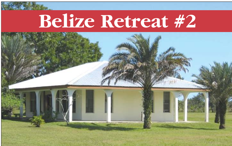
Side view of the chapel at Trinidad Farm in Belize

In February of 2006 twenty White House men made a retreat at Trinidad Farm, the Jesuit Retreat House in the country of Belize in Central America. While it was a retreat experience there were other dimensions to the trip. It raised money to help maintain and improve Trinidad Farm. It was also a cultural experience and vacation. In addition to the daily prayer times the retreatants also had an excursion to a Maya ruin and another to one of Belize's beautiful offshore islands for swimming and snorkeling. Many thought that the highlight of the retreat trip was attending Mass at St. Martin's parish in Belize City for the monthly Eucharistic celebration by one of Belize's ethnic groups, the Garifuna people. Processions, drumming and singing in the